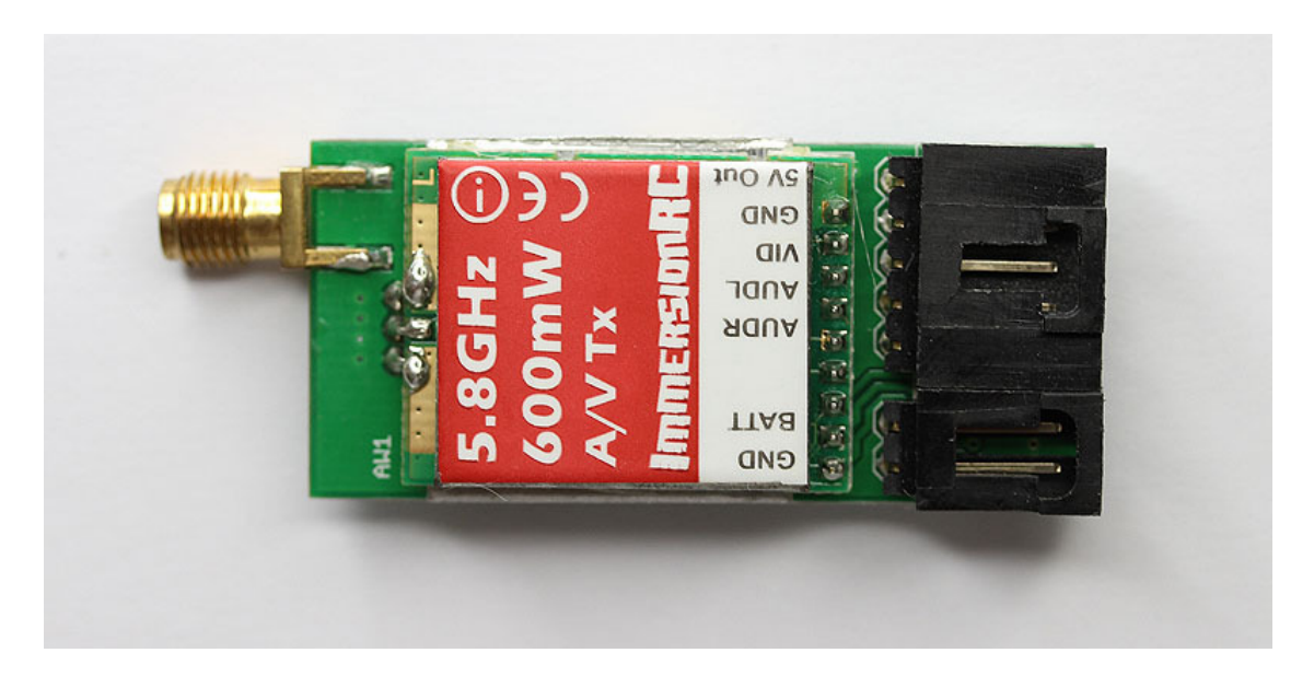
Fig 1. Top side of ImmersionRC 600mW 5.8GHz audio/video transmitter.

The ImmersionRC 600mW 5.8GHz audio/video transmitter requires a suitable antenna (included) and a supply voltage to be connected to be functional. Please refer to the below noted images for familiarizing yourself with your audio/video transmitter prior to connecting the audio/video transmitter to your power supply and camera or audio/video source: