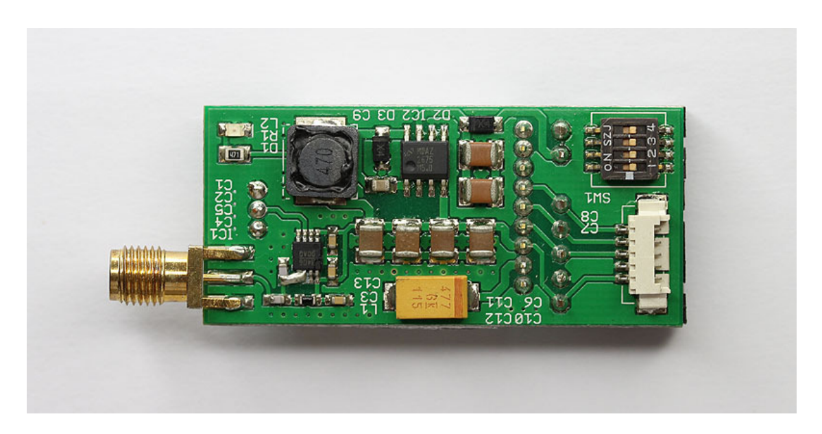
Fig 2. Bottom side of ImmersionRC 600mW 5.8GHz audio/video transmitter.

Bottom left > SMA female connector, connect your antenna here.